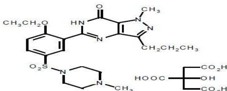
Figure 1: The chemical structure of Sildenafil Citrate

The developed simultaneous equation method is found to be simple, sensitive, accurate and precise and can be used for routine analysis of SIL and DPX. The developed method was validated as per ICH guidelines. Statistical analysis proved that the method is repeatable and selective for the analysis of SIL and DPX in their combined pharmaceutical formulations.